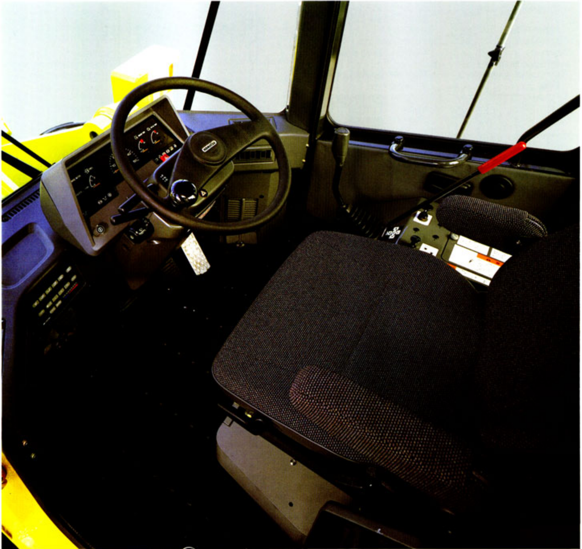
Photo shows model with four-speed transmission. Model shown may include optional equipment.